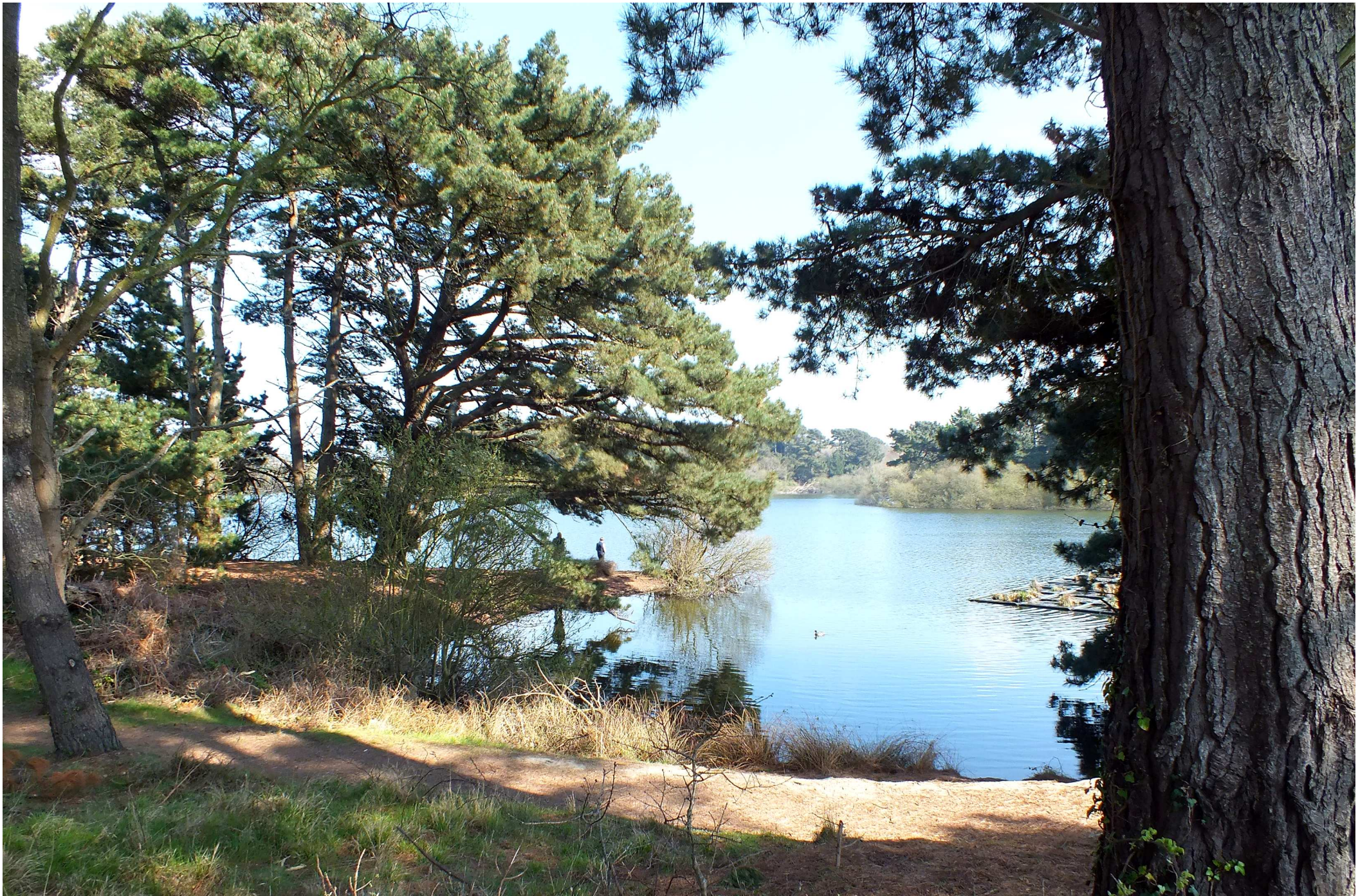
The Millennium Walk at St. Saviour's Reservoir