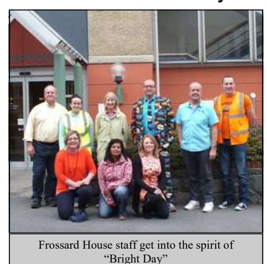
Our annual dress down day, "Bright Day", was held on 28th October this year—just before the clocks go back at the end of summertime.

We ask employees to dress up in bright or light clothes to emphasise our BE SAFE BE SEEN message Everyone needs to wear light (or preferably high visibility) clothes at night when walking or cycling on Guernsey's dark roads. We recommend you cover your office suit even if you are simply going to pick up your car.