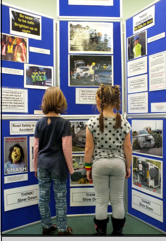
The Living Streets Road Safety Week display was set up this year in the entrance hall at La Mare de Carteret Primary School.